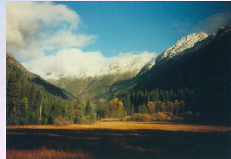
Morris Meadow Trinity Alps, California

The Universe has and must have manifestation and Identity In acute, diffuse and absent phases.