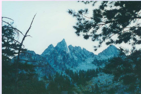
Cirque above Papoose Lake Trinity Alps, California

While in limited form realization is endless process And ever freshness in variety—A Journey in Being.