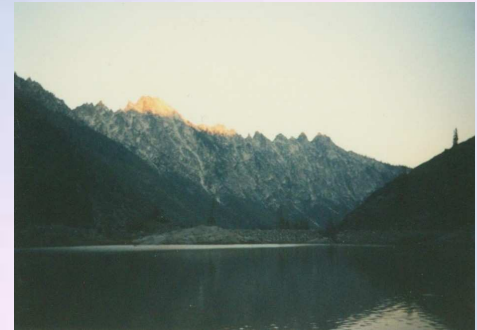
Papoose Lake Trinity Alps, California

The places of realization are the Ground—nature—and Fabric—individual, society and culture—of Being and Civilization which link the immediate to the ultimate.