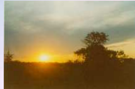
Sunset Bear, Delaware

Any metaphysics that agrees with standard cosmologies— And their principles of reasoning—in their domains of Validity is allowed by those cosmologies and principles.