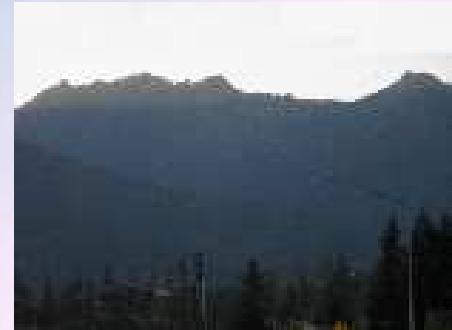
In the shadow of mountains Weaverville, California

The Void which is the absence of Being exists and Contains no Law. The Void may be regarded to be Part of every element of Being.