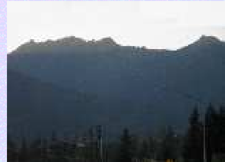
In the shadow of mountains Weaverville, California

The Void which is the absence of Being exists and Contains no Law. The Void may be regarded to be Part of every element of Being.