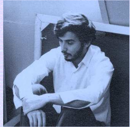
Author, Delaware, age 26