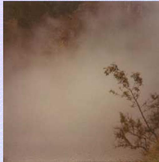
Storm Barranca del Cobre

The object of Realism (Logic) is the Universe. All valid science and Systems of logic lie within Logic. Universal metaphysics and science Have no conflict. Just as the Universe is all Being, so the metaphysics Is an envelope for all knowledge including science.