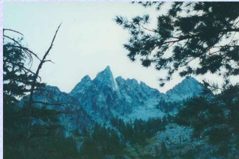
Cirque above Papoose Lake Trinity Alps, California

While in limited form realization is endless process And ever freshness in variety—A Journey in Being.