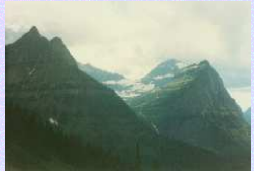
Glacier National Park Montana

Ultimate realization for all beings is given By the metaphysics. However, efficiency and enjoyment Are immensely enhanced in occurrence and quality By commitment and engagement.