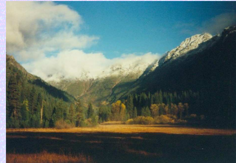
Morris Meadow Trinity Alps, California

The Universe has and must have manifestation and Identity In acute, diffuse and absent phases.