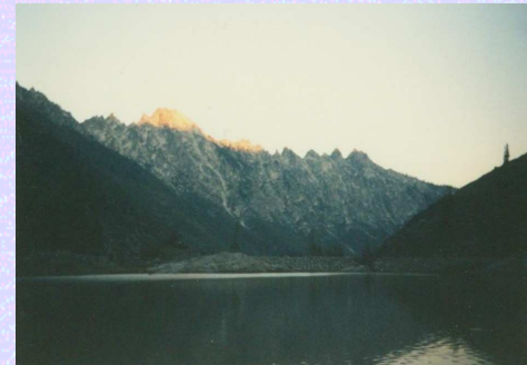
Papoose Lake Trinity Alps, California

The places of realization are the Ground—nature—and Fabric—individual, society and culture—of Being and Civilization which link the immediate to the ultimate.