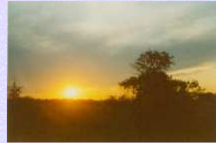
Sunset Bear, Delaware

Any metaphysics that agrees with standard cosmologies— And their principles of reasoning—in their domains of Validity is allowed by those cosmologies and principles.