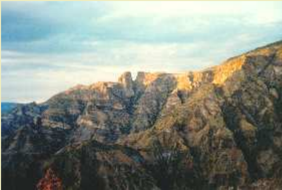
Barranca del Cobre, Mexico

Pictures in the text show places of inspiration.