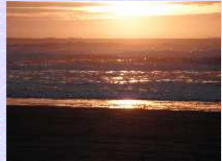
Pacific Ocean Humboldt County, California

In foundation in Experience and Being the metaphysics is Perfect. From expression as Logic it is unique—as container of All special metaphysics; and ultimate—in complete but partially Implicit capture of the variety, extent, and duration of Being.