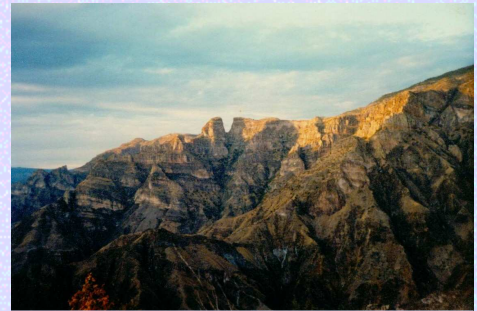
Barranca del Cobre, Mexico (Copper Canyon)

Meaning is sometimes seen as fixed—but has no final Determination outside process. New experience and established Use balance fluidity and fixity in setting meaning.