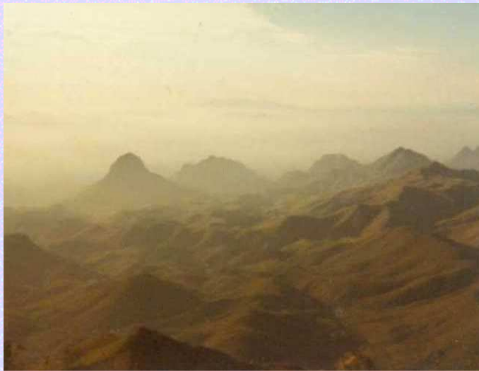
South Rim—Big Bend Nature pictures show places of inspiration