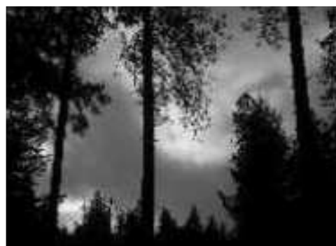
Trinity Alps—Storm from a Gap in the Trees

The author and his inspiration —I live in Northern California. I love to backpack in wilderness areas. The photographs in Journey in Being show places where I have had much inspiration for the ideas of this book.