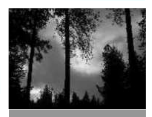
Trinity Alps—Storm from a Gap in the Trees

The author and his inspiration—I live in Northern California. I love to backpack in wilderness areas. The photographs in Journey in Being show places where I have had much inspiration for the ideas of this book.