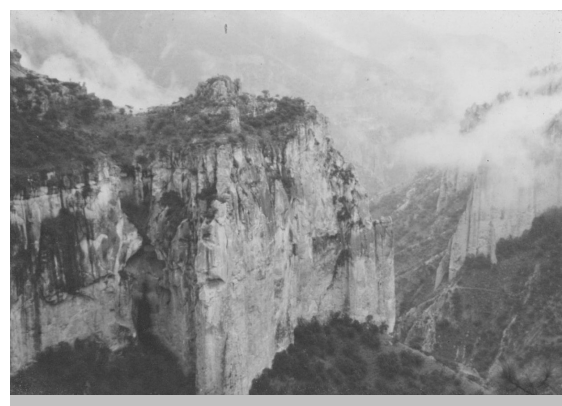
Pictures in the text show places of inspiration for the ideas and realization.

Journey in Being presents an exciting view of the universe as limitless realization. This view is proved—this makes it especially empowering.